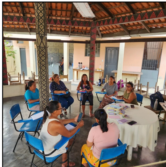
Meeting space behind the AMARN Center. Second generation women