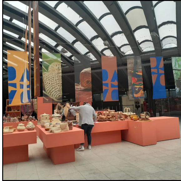
Expo center, Manaus, with AMARN women's crafts on display