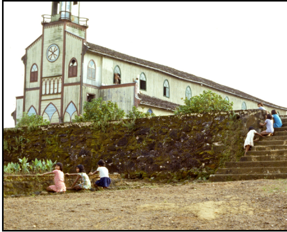
Misson, Brazil, 1978: Girls scrubbing rocks