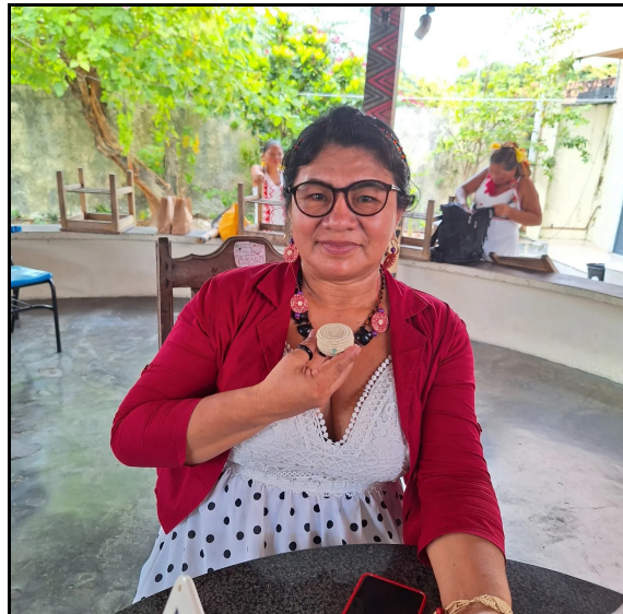
AMARN woman showing her AMARN pendant