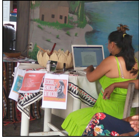
AMARN workspace, 2015