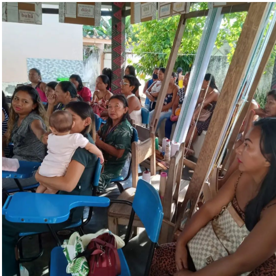
AMARN Center meeting