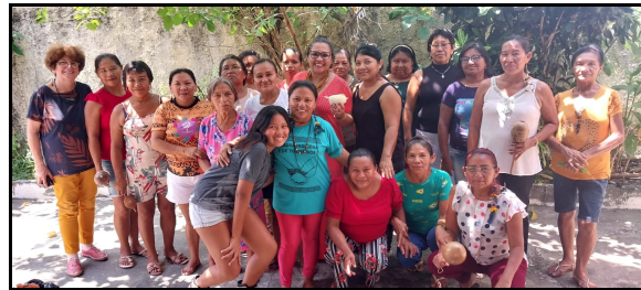
Group photo, showing the second generation of members