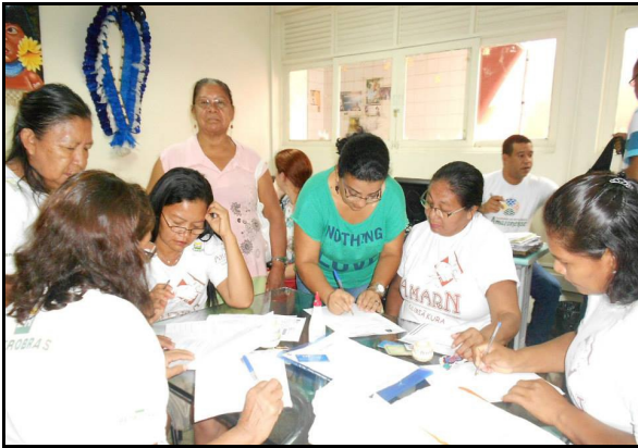
AMARN workspace, 1995